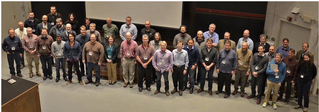
Photo: Attendees of the S2I2-HEP/CS Workshop at the University of Illinois in December 2016